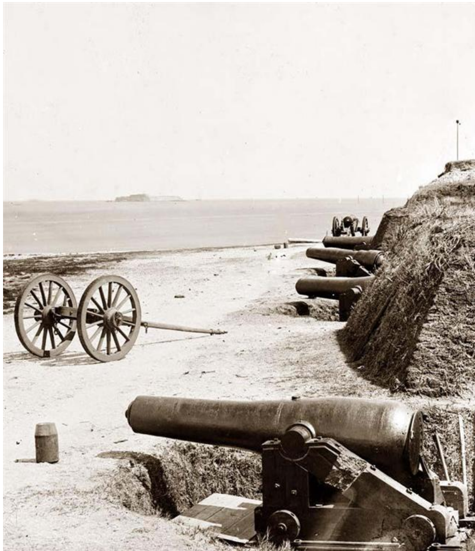
Picture of Ft Johnson with Fort Sumter in background. http://www.old-picture.com/civil-war/Johnson-Fort-001.htm

Above picture found in the March 2, 1861 edition of Harper's Weekly. http://www.sonofthesouth.net/leefoundation/civil-war/1861/march/fort-johnson.htm