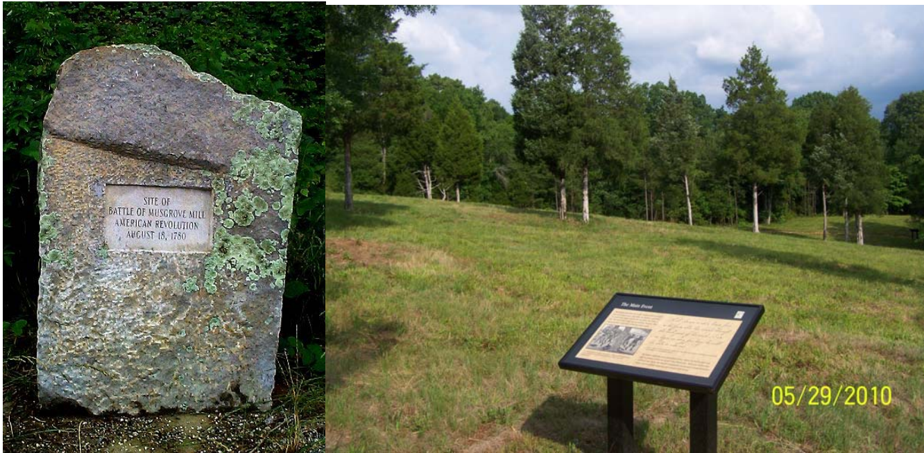
Battle field marker