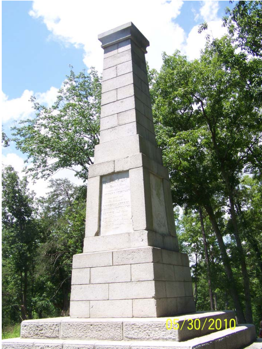
Another monument at King's Mountain