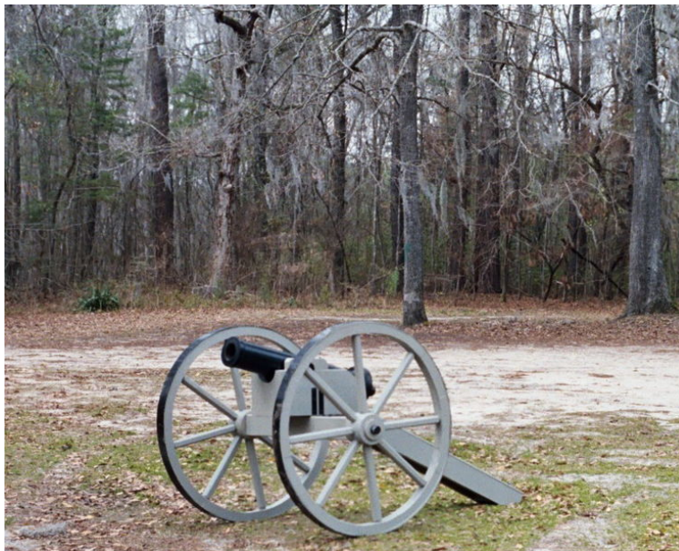
Replica of cannon used at Battle of Brier Creek