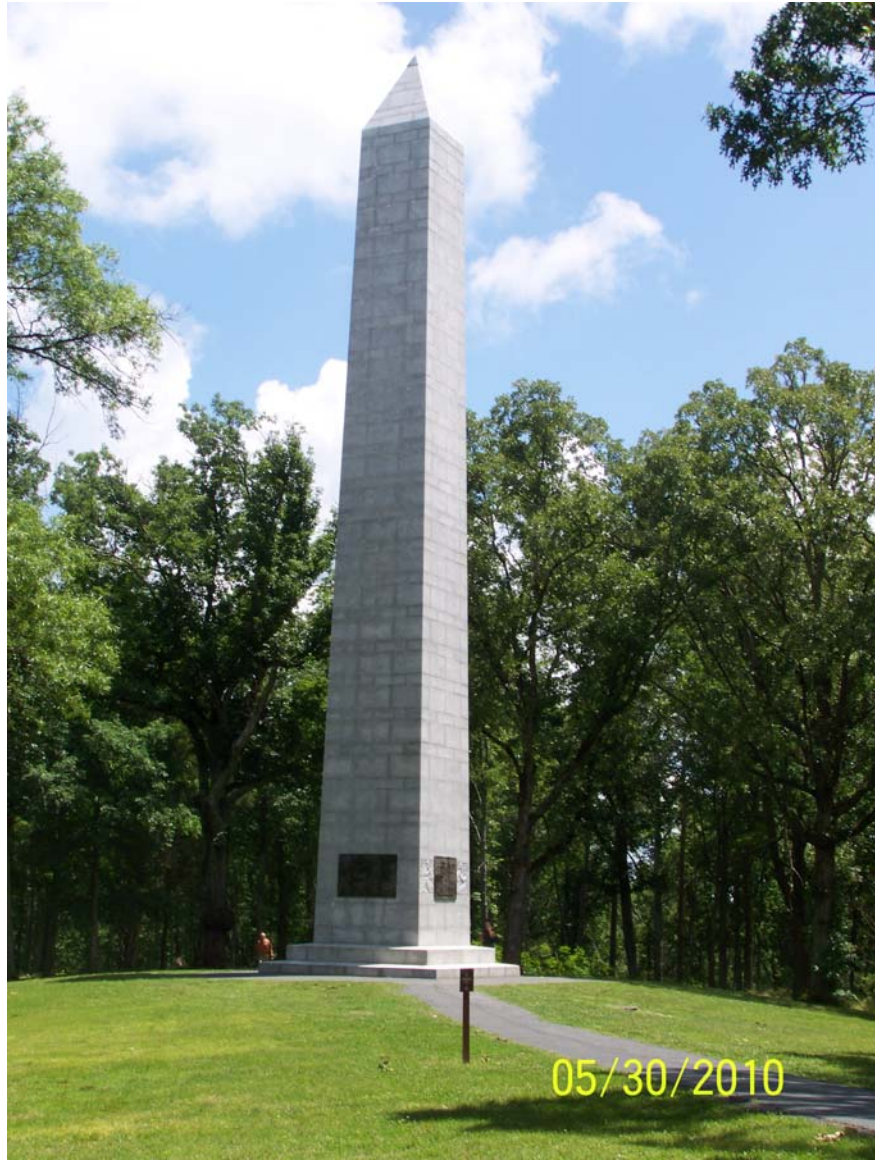
Monument below found at King's Mountain