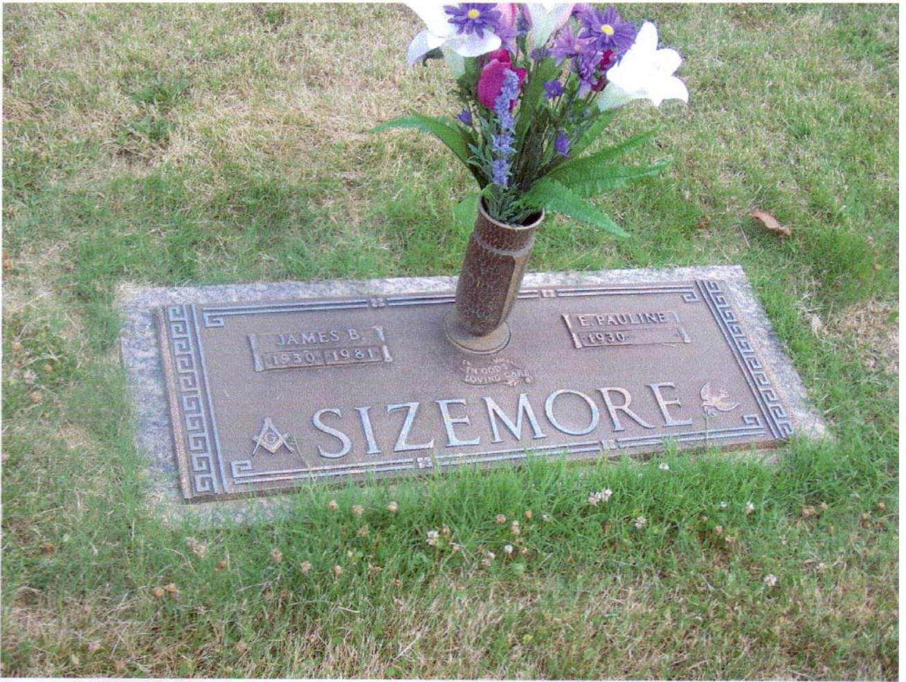
James Sizemore is buried in Oak Hill Cemetery, Kingsport, TN