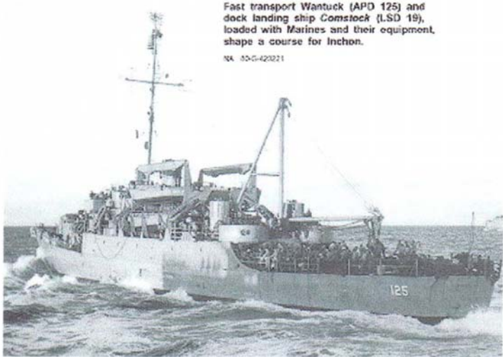
Fast transport Wantuck (APD 125) and dock landing ship Comstock (LSD 19), loaded with Marines and their equipment, shape a course for Inchon.