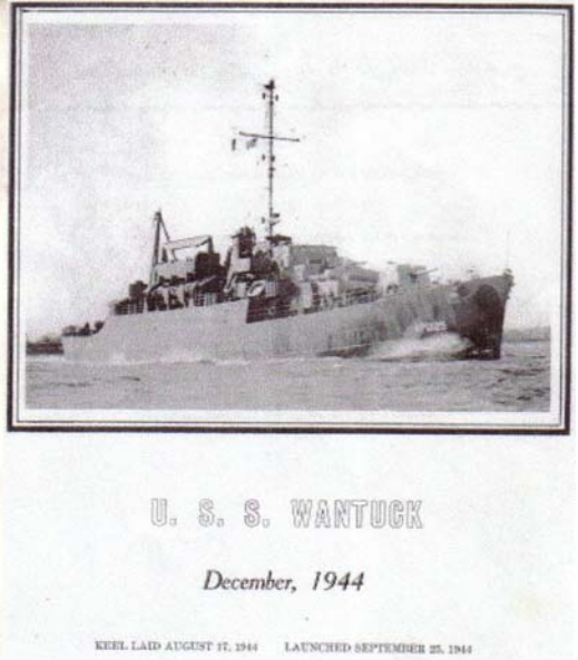
U. S. S. WANTUCK